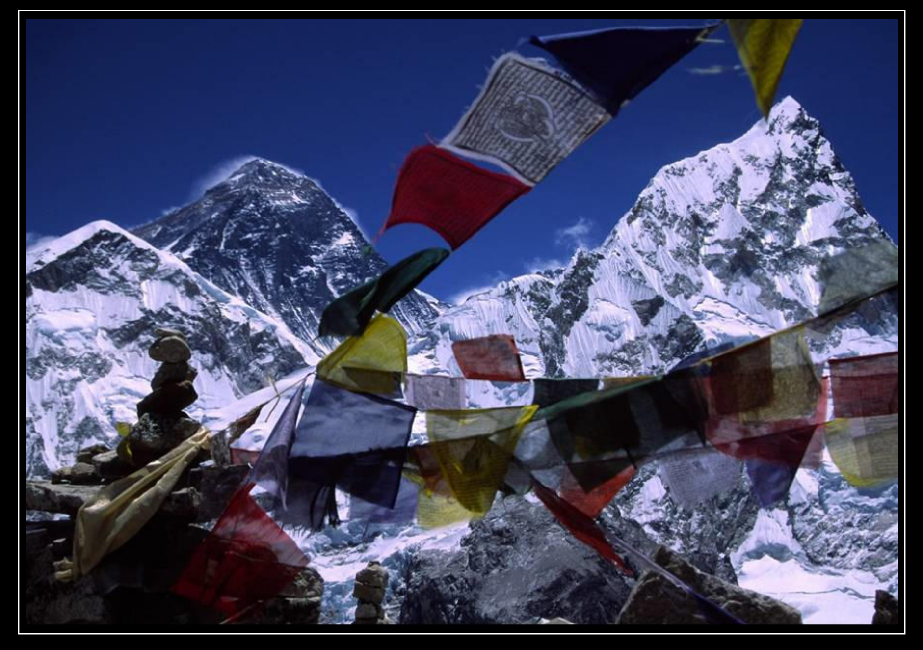
Strive for your future goals in the distance without forgetting the beautiful frame of the presence. Bonus-Pic: View on Mount Everest (8848 m) left and Nuptse (7855 m) right from the viewing point Kala Pattar (5565 m) – May 2005