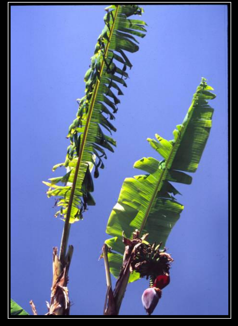
© Grow with your surroundings: recognise the common ground and respect the differences. © Banana leaves and fruits on my way from Bandhar to Kenja in the Solo Khumbu region – April 2005