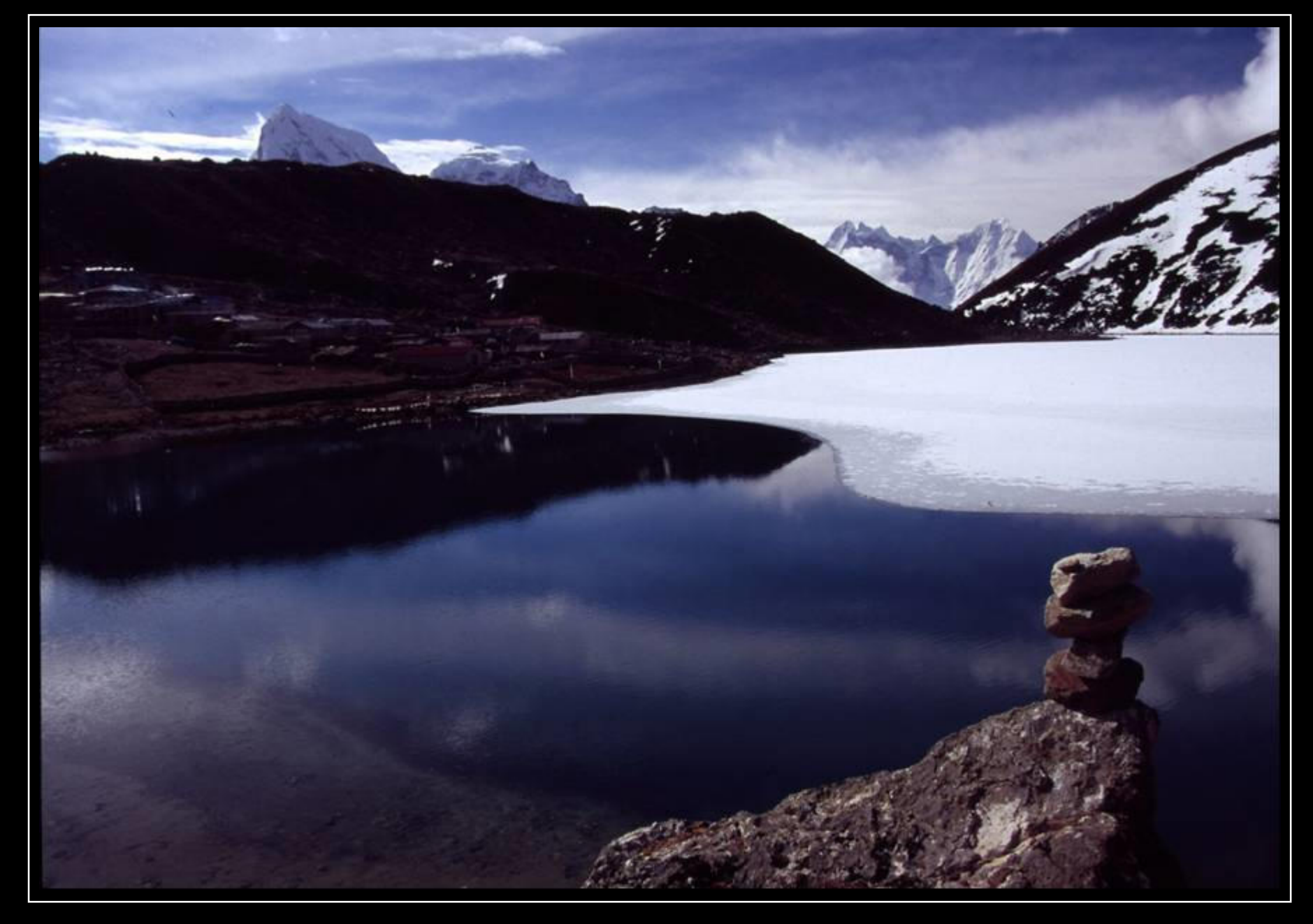
• Melt your deep frozen thoughts and be delighted about the freshness of change. © View on one of the five lakes on my way to Gokyo Peak (5483 m) – May 2005