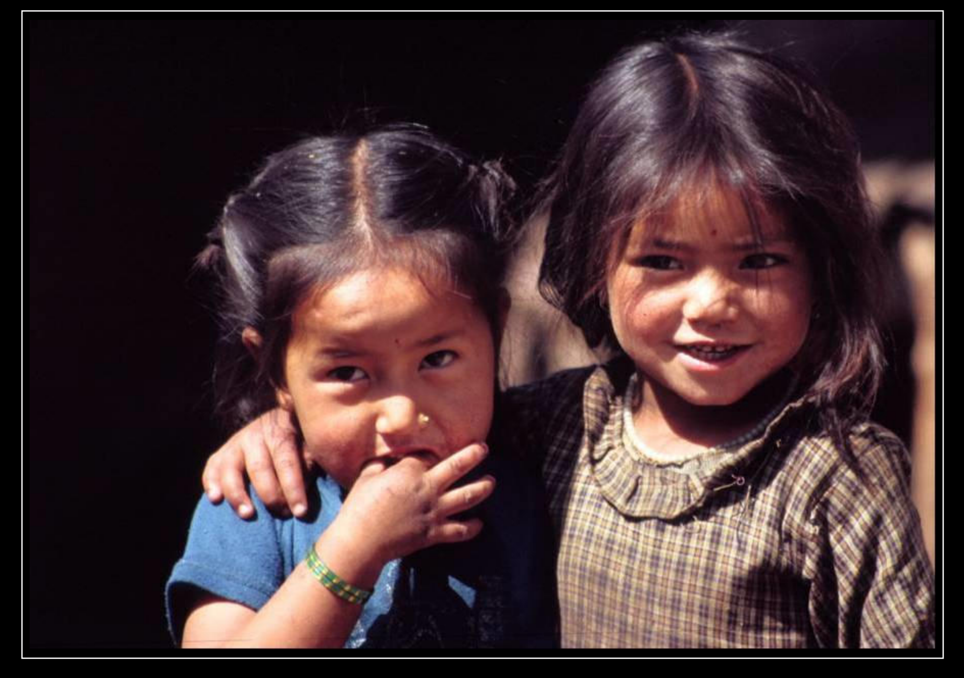
Put your arms around the shoulders of people, who need your power, courage and warmth. © Girlfriends on my way from Bandhar to Kenja in the Solo Khumbu region – April 2005