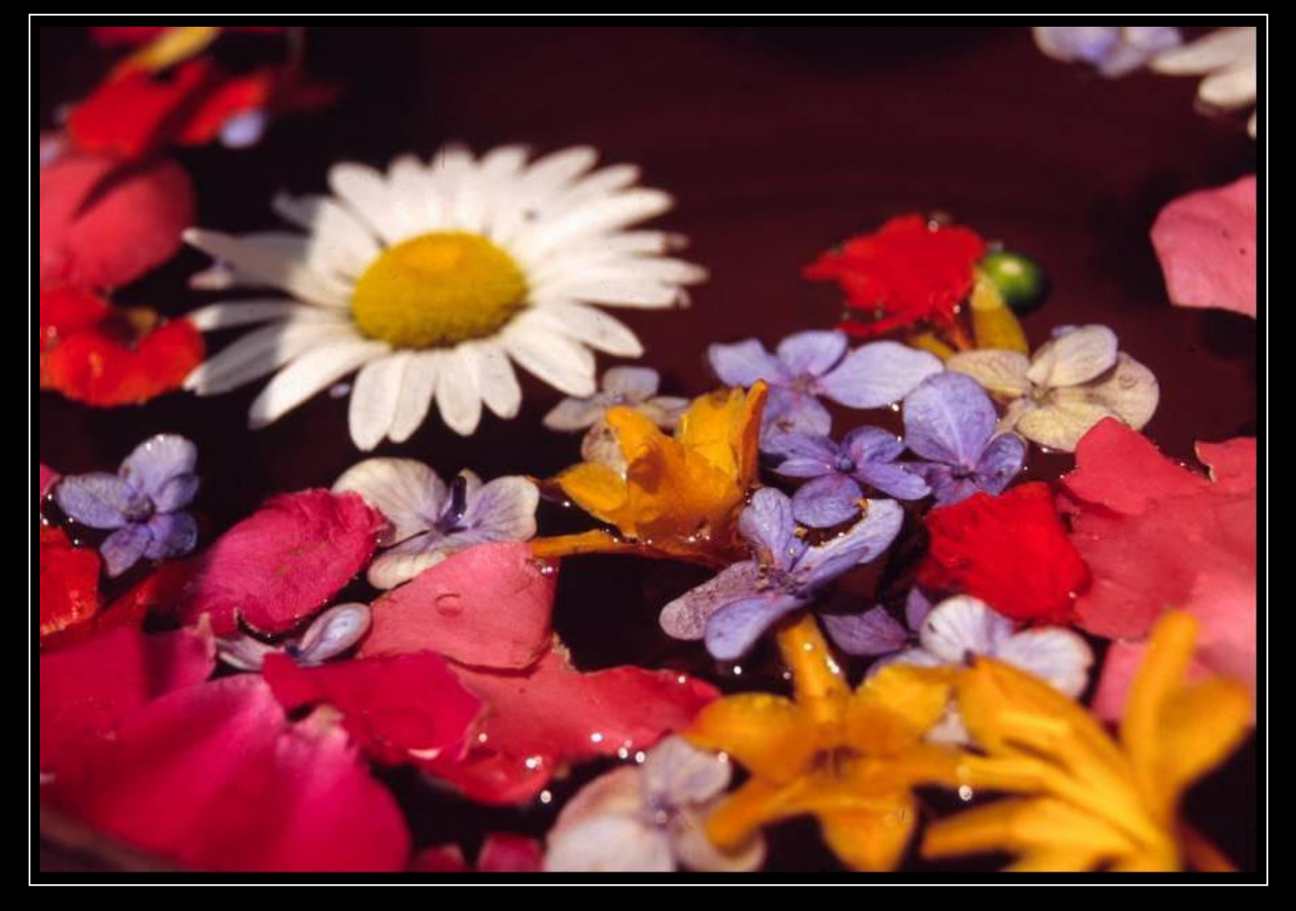
© Flourish and sunbathe self-confidently in the unique splendour of your colors and forms. © Schwimming flower-potporri at the Farmhouse Hotel of Nagarkot (2168 m) (ca. 35 km east of Kathmandu) − June 2005