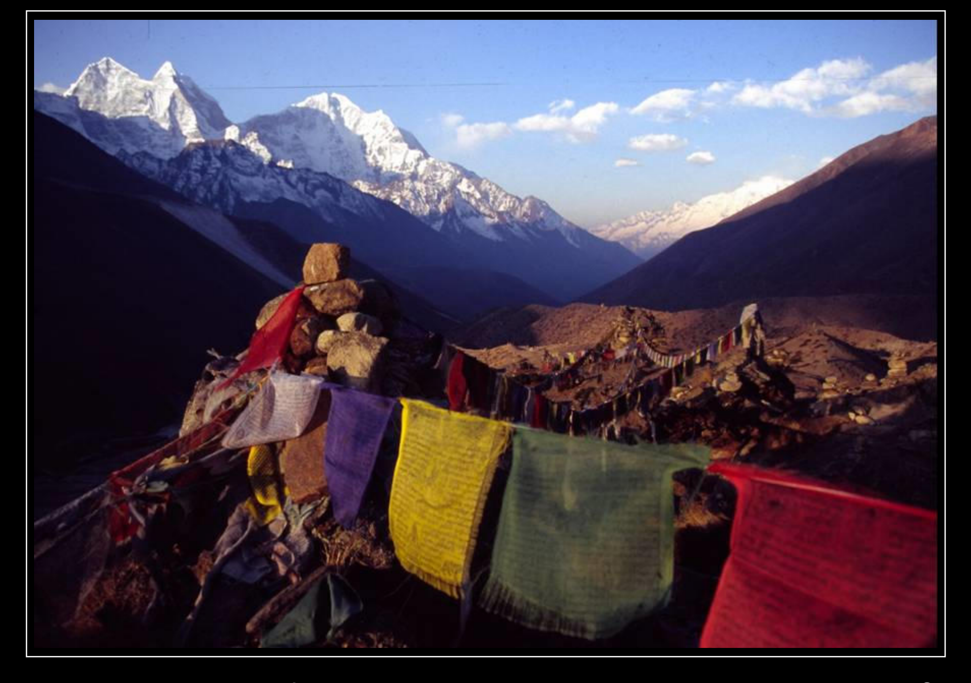
• "The highest mountains of planet earth embrace you. Here nature reigns and universe begins!" © Prayer flags flutter devoutly on Dingboche Peak (5.068 m) spreading their buddhistic messages into the heights of Khumbu – May 2005