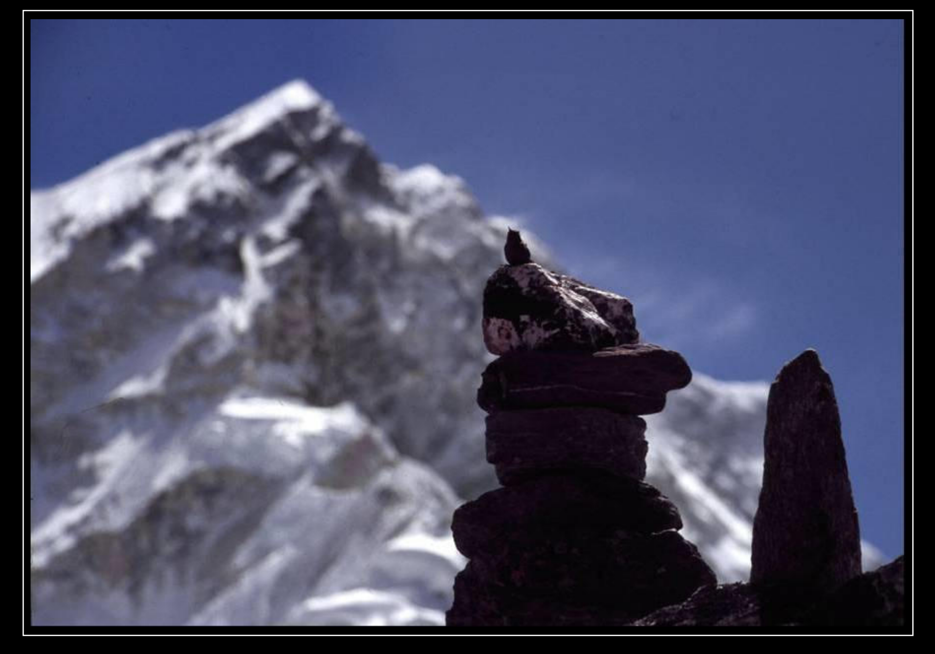
Sing and fly like a bird. Then your real significance will appear. Bird twitters joyfully around (in the background Nuptse (7855 m)) on my way to Gorak Shep (5160 m) – May 2005