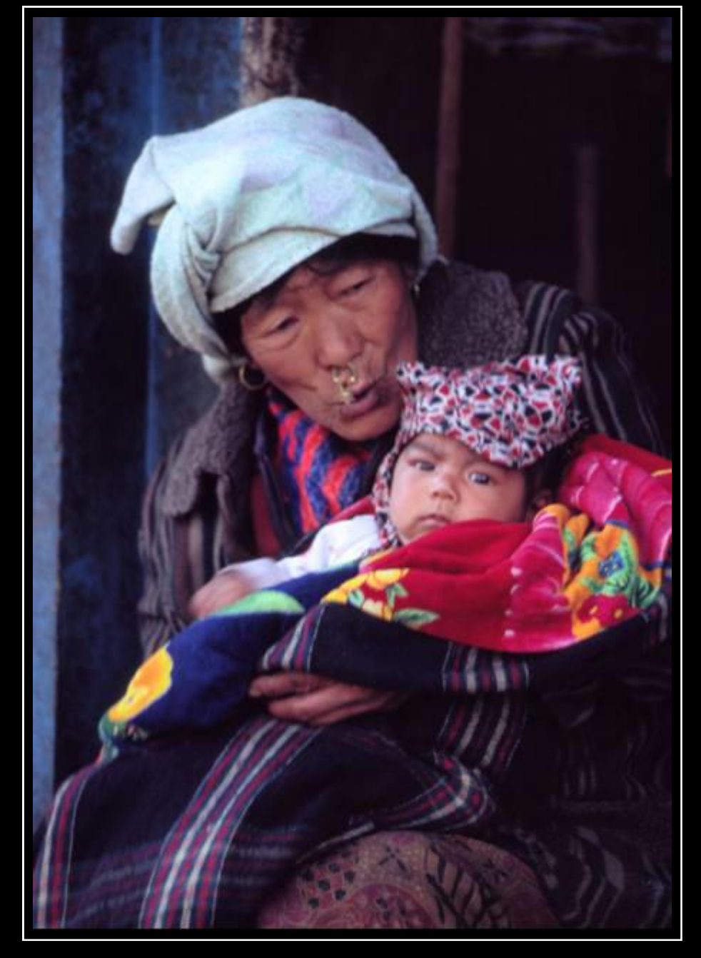
Surround yourself with people, who give you security, comfort and a well feeling. © Granny with grandchild on my way from Junbesi to Nuntala in the Solo Khumbu region (East-Nepal) – April 2005