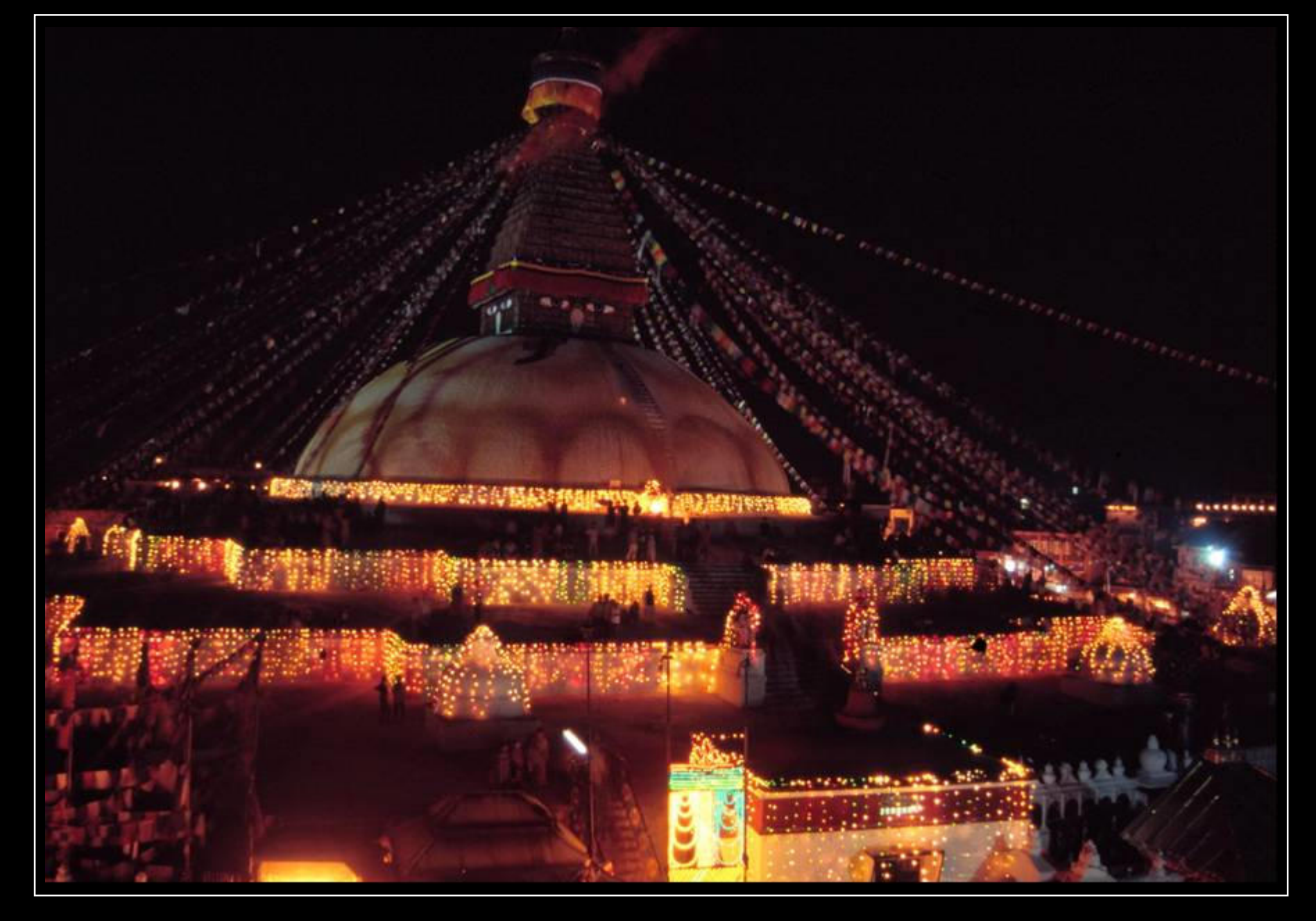
Light the lights of your soul and illuminate the earth and its people with your love and care. Stupa of Bodnath on the evening of Buddhas Birthday (full moon night in the month of Baisakh) – May 2005