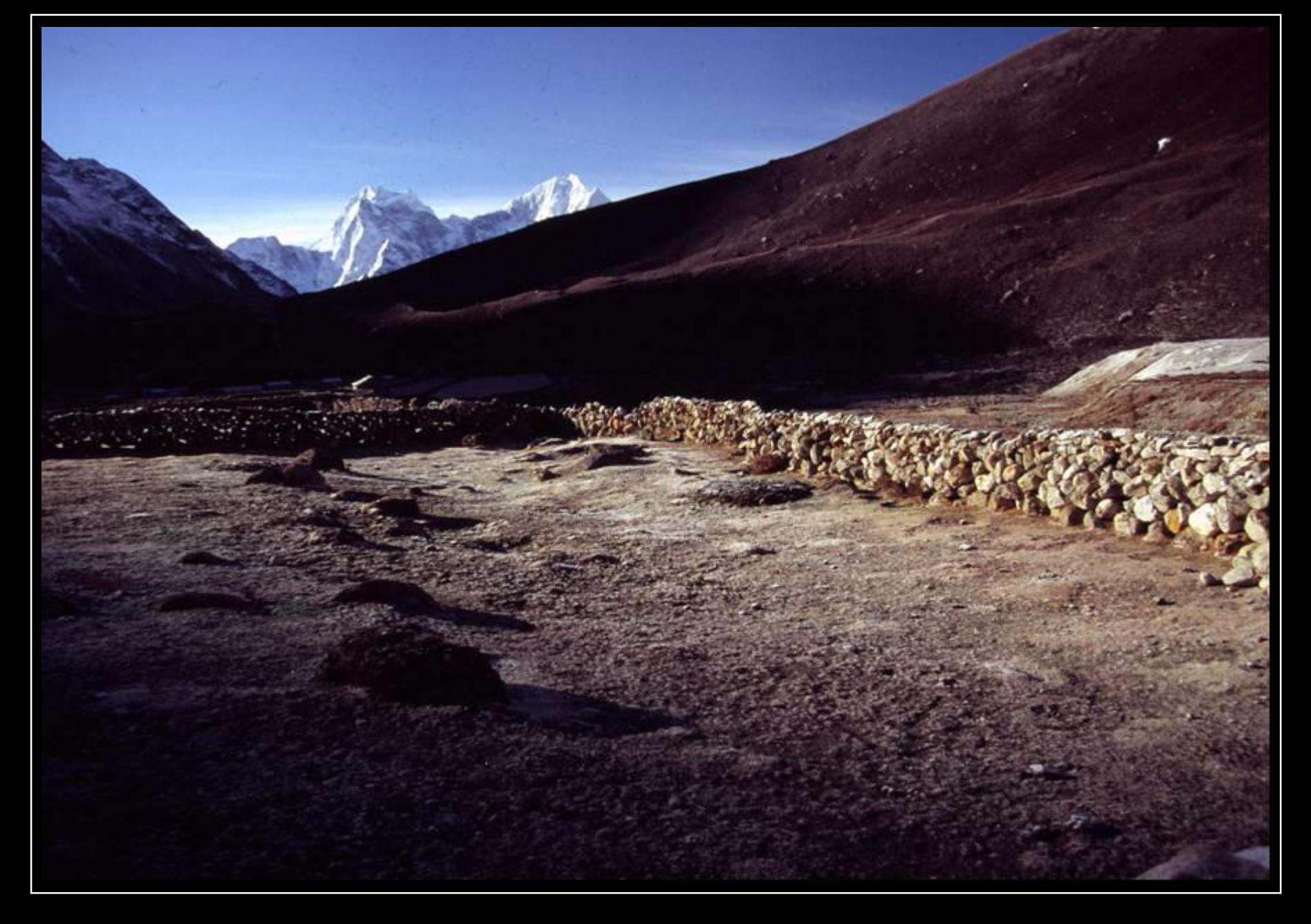
You can do it without walls: light and shadow, joy and suffering cannot be stopped for any reason. □ Dawn on a meadow for yaks near Machermo (4479 m) in the Khumbu region – May 2005