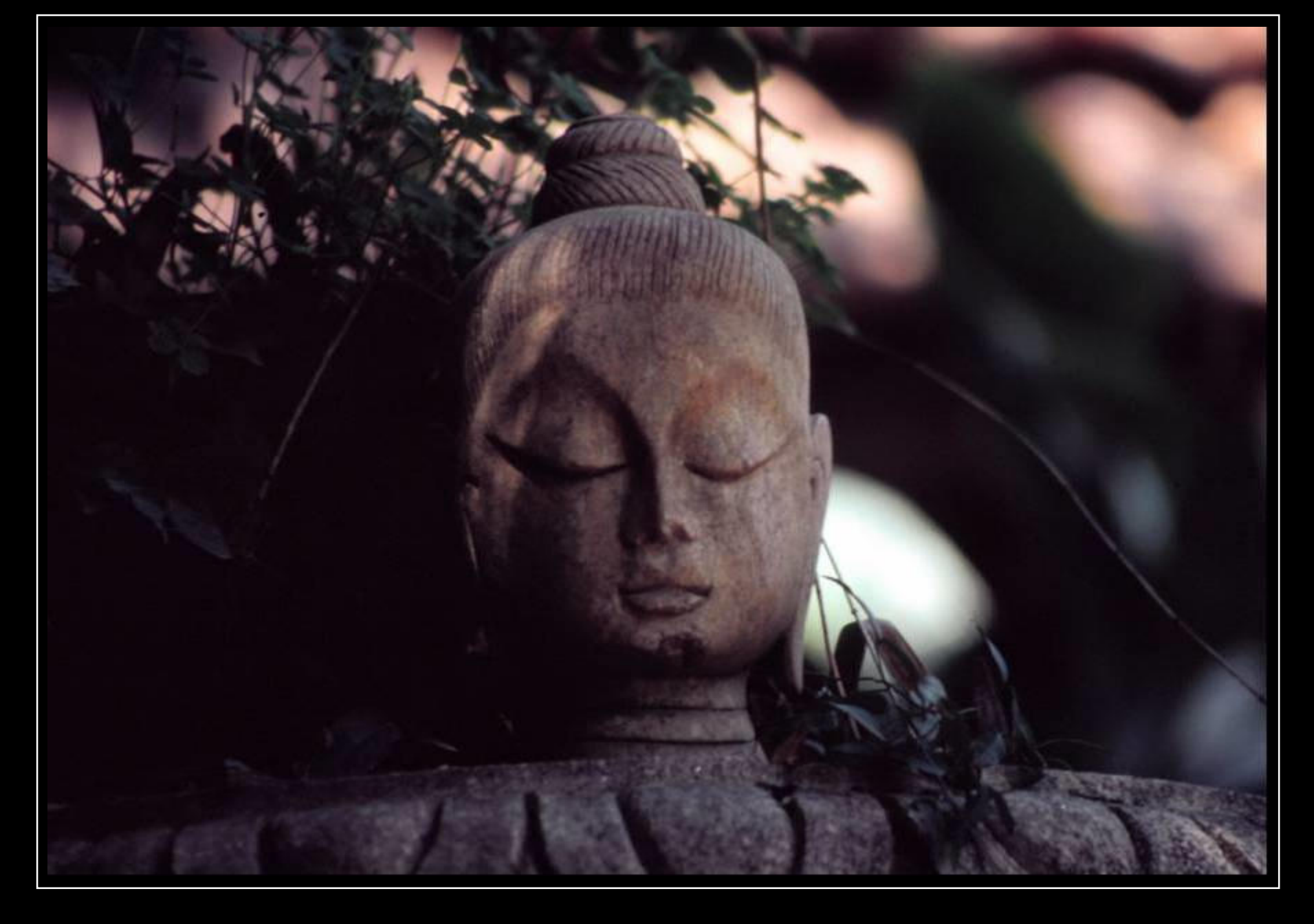
© Close your eyes regularly and listen, what your inner voice has to tell you. © Reclining statue of the Buddha in the garden of Mike's Breakfast (Restaurant in Kathmandu) – April 2005